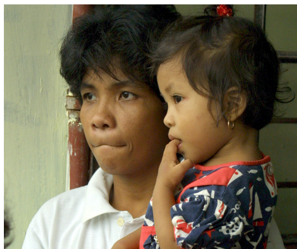
4Ps works with the beneficiaries in ensuring their health and education.