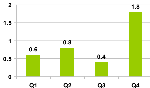
Figure 2 Capital Formation (constant, %)