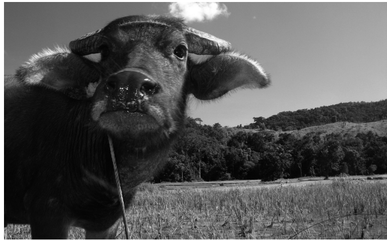
Bad weather dealt a huge blow to farm output during the year