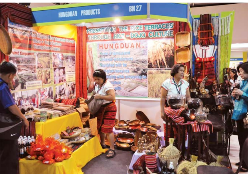
Booth featuring products from Hungduan, Ifugao at the NEDA PEP Exhibit

Disaster Risk Reduction (DRR) & Climate Change Adaptation (CCA). In line with its advocacy to mainstream DRR and CCA in local development plans, NEDA continued to