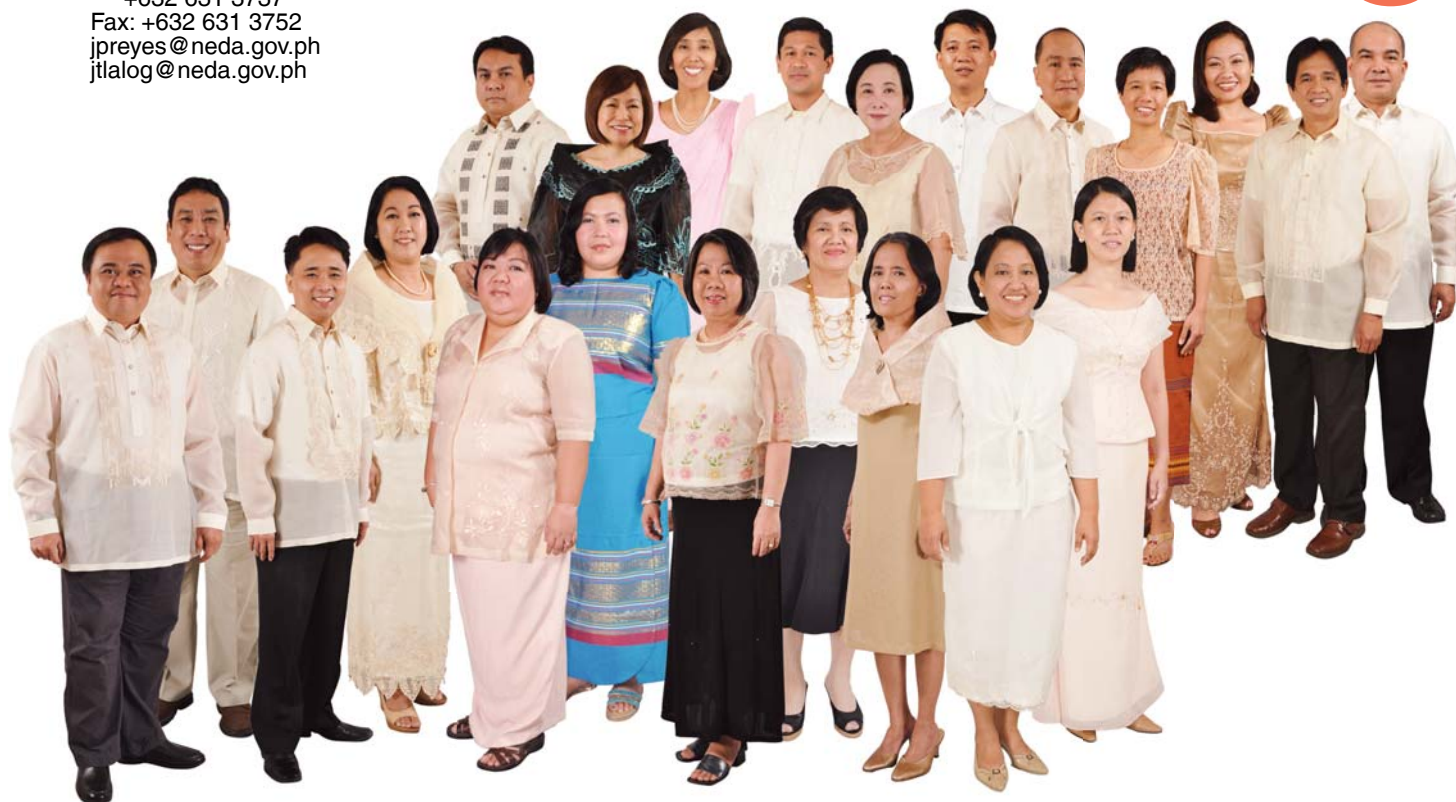
As of June 30, 2011