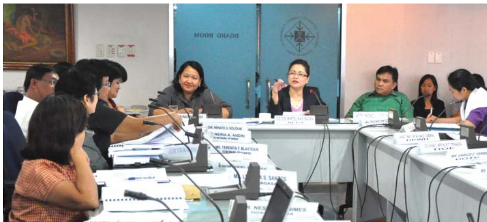
NEDA Board-National Land Use Committee Meeting

Philippine Council on Sustainable Development (PCSD). As the lead Secretariat of the PCSD, NEDA facilitated the strengthening of the PCSD to localize sustainable development (SD) in the country. Activities to achieve this include: (a) integration of SD strategies in the guidelines for the preparation of the Philippine Development Plan 2011-2016; (b) reactivation of the Committee on Strengthening the Role of Major Groups; and (c) creation of IEC materials on SD core message and popularized Enhanced Philippine Agenda 21 (EPA 21), among others.