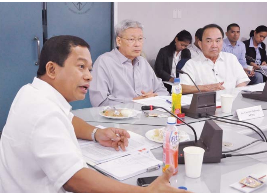
InfraCOM meeting, August 2010

Committee on Tariff and Related Matters (CTRM). NEDA provided technical support to five policy documents that was reviewed under the CTRM, Interagency Committee on Tariff in Services, and Philippine Council on ASEAN and APEC Cooperation-Technical Board on Economic Cooperation. The documents reviewed were: (a) tariff proposals on EOs 862, 863, 885 that aim to stabilize prices of various agricultural products, construction materials, books, among others; (b) EOs 892, 894 and 895 that aim to increase market access and regional trade and investments; (c) the Philippine tariff reduction schedule; (d) country requests on trade and services from World Trade Organization members; (e) review and formulation of Philippine positions on ASEAN-China Trade in Services and ASEAN-India Trade in Services agreements, ASEAN