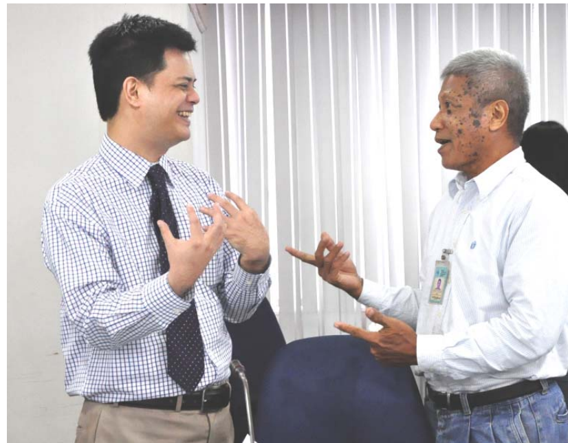
Briefing on the Aquino Administration's Platform of Government

Poverty Reduction and Support to the MDGs Programme. Aside from the facilitation/coordination of the 2010 Progress Report on the MDGs, the project facilitated the production of nine provincial MDG Progress Reports, and coordinated the conduct of three important studies namely: (a) Assessing Development Strategies to Achieve the MDGs in Asia and the Pacific; (b) Review and Assessment of the Implementation of Social Reform and Poverty Alleviation Act (RA 8425); and (c) Assessing Compliance, Performance and Results of the Gender and Development (GAD) Budget of the Philippines.