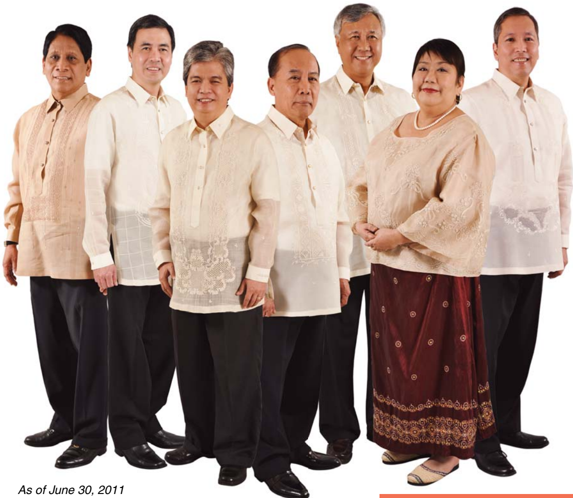
As of June 30, 2011