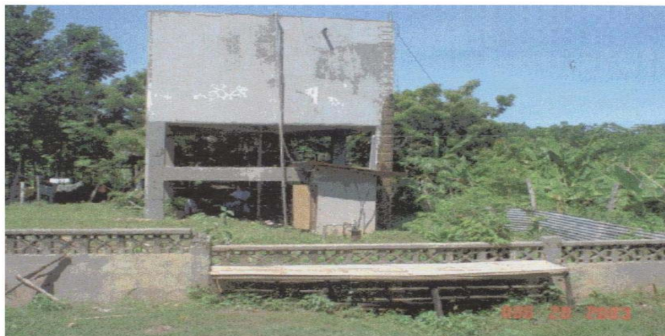
Existing Well 1 Tank, Libertad Municipal Waterworks Libertad, Misamis Oriental, Region 10