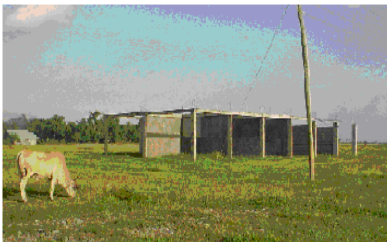
Project site for the Public Market Cum Slaughterhouse in San Isidro, Isabela

77 pre-investments studies, master planning activities and capacity building programs worth PhP 26.40 million have been undertaken through the PDMF