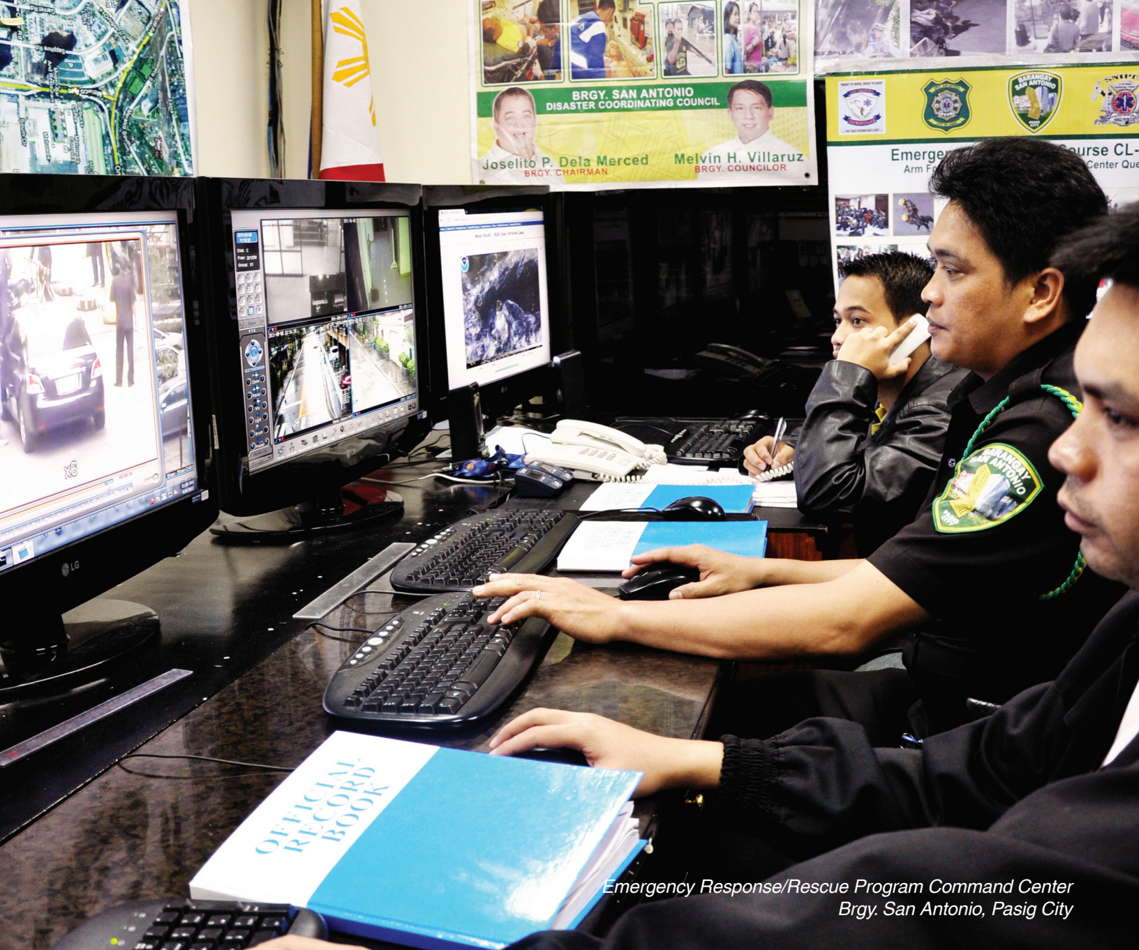
Emergency Response/Rescue Program Command Center Brgy. San Antonio, Pasig City