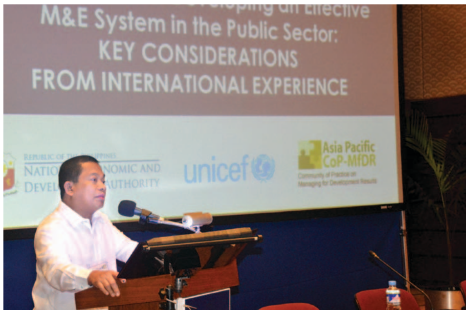
NEDA Deputy Director-General Rolando G. Tungpalan addresses participants at the 3rd M&E Network Forum.

NEDA's rationalization in 2013 institutionalized the monitoring and evaluation (M&E) of government programs and projects (PAPs) as one of the agency's major functions. While the scope of NEDA M&E used to be limited to only PAPs funded through official development assistance (ODA), it now also covers those deemed strategic in attaining inclusive growth. Under Strategy 3, NEDA has helped the government in determining timely and strategic interventions through the development of M&E frameworks, tools and reports.