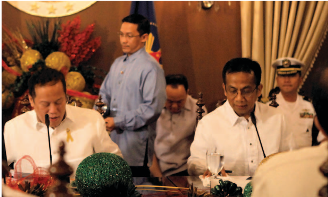
President Benigno S. Aquino III presides over the National Economic and Development Authority (NEDA) Board Meeting at Malacañan Palace. With the President is Socioeconomic Planning Secretary and NEDA Director General Arsenio Balisacan.

NEDA worked to ensure timely delivery of comprehensive and accurate development plans, economic reports and technical analyses on pressing development issues. Such outputs guided national and local development planners—within and outside of government—in coming up with different sector and area-based plans, for development to be inclusive in benefiting every Filipino.