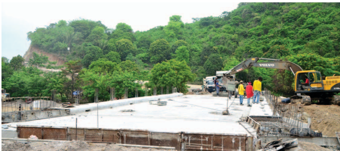
The Ternate-Nasugbu Road is part of the CALABARZON Ecotourism Circuit, that will help boost tourism development in the area. The project has been identified by NEDA as one of the major infrastructure investments in the region.

To execute development plans (see Strategy 1), adequate funding needs to be channeled to government agencies for them to implement programs and projects (PAPs). Given the government's limited resources, Strategy 2 entails that NEDA lead the entire bureaucracy in formulating public investment programs and reviewing proposed major PAPs to achieve inclusive growth. Under this strategy, the priorities and refinements in the PDP 2011-2016 Midterm Update have been translated into the guidelines of the Department of Budget and Management for its budget call for the succeeding year. Similarly, local and international development partners have aligned their investment strategies and development assistance according to the country's strategies, thus directing resources in areas and sectors where they are needed.