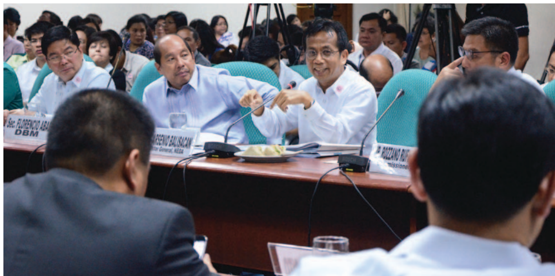
From left: Bangko Sentral ng Pilipinas Governor Amado M. Tetangco Jr., Budget Secretary Florencio B. Abad, and Sec. Arsenio M. Balisacan at the Senate Hearing on the 2014 budget.

Implementing this strategy requires NEDA and its attached agencies to provide technical inputs on and impact analyses of specific policy proposals of socioeconomic nature. For evidence-based policy advice, the Philippine Statistics Authority (PSA) issues guidelines on statistical matters. The Tariff Commission (TC) and the Philippine National Volunteer Service Coordinating Agency (PNVSCA) provide policy services on tariff and volunteer assistance, respectively. All these have supported the country's aim of enhancing its competitiveness, productivity and social development, towards attaining inclusive growth in the medium term.