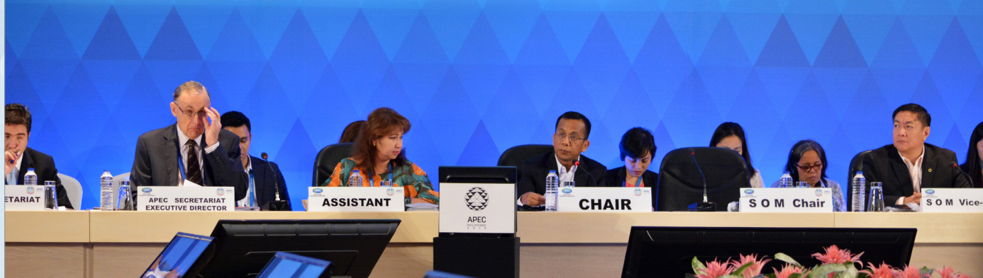
NEDA serves as chair in the 2nd APEC Structural Reforms Ministerial Meeting.

September 07 - 08, 2015 | Cebu City, Philippines