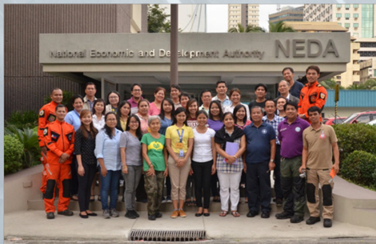
Training on Disaster Preparedness and Basic Emergency Response held last October 2015. The training was participated in by personnel from the NEDA Central Office

NEDA personnel in the central and regional offices also participated in different capability building activities on programming in STATA, leadership and management, impact evaluation, policy analysis, tariff classification, RPMES orientation, inclusive growth and regional development planning, disclosure policy and records management, coaching and mentoring, project development, Orientation Seminar on Executive Order 608, Training on Integrating GAD in Planning Project Development, Monitoring and Evaluation and Developing a Results-Based Management Framework, RA 9184 orientation, among others.