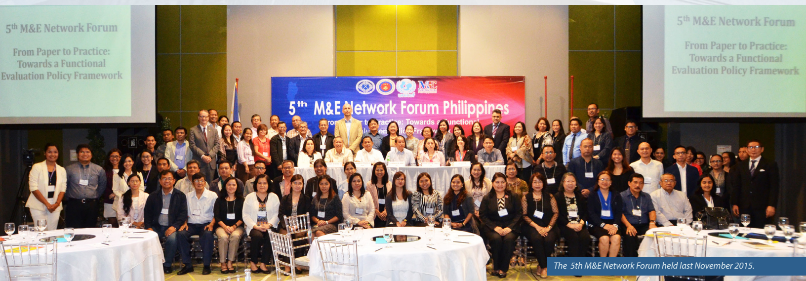
The 5th M&E Network Forum held last November 2015.

The PSRTI also conducted trainings on project impact evaluation or the Impact Evaluation of Development Projects using STATA from September 28 until October 2, 2015. It also conducted 33 training courses including one international course to provide participants with practical knowledge, skills, and experience in various aspects of statistical work. These regular and customized courses covered the areas of data collection and processing, database management, data analysis and statistical modelling, among others. Customized training courses were conducted in collaboration with different agencies, including NEDA, TESDA, PSHS, PAG-IBIG Fund, ERBSI-EWS-CAR, ARMM, UNESCAP/SIAP, among others.