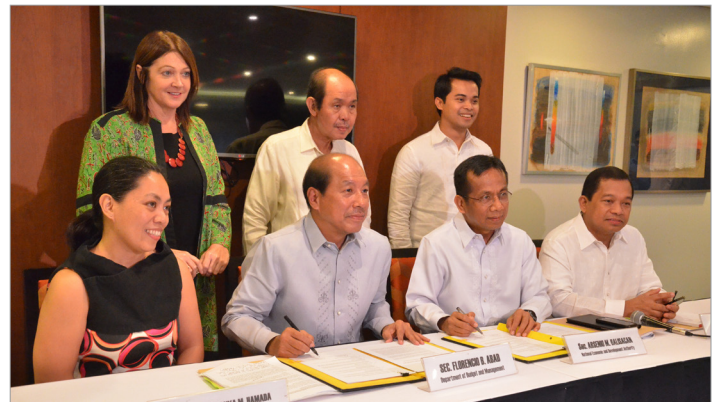
The formulation of the National Evaluation Policy Framework through the NEDA-DBM Joint Memorandum Circular No. 2015-01 was signed by NEDA and DBM on July 15, 2015.

Knowledge-sharing on new models of development and institution building