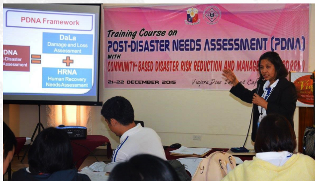
NEDA Regional Office XII conducts orientation/training on post-disaster needs assessment.

In 2015, NEDA also conducted the Capacity Building for the Development of Threshold 21 (T21) Model for the Philippine Long-Term Vision Project. The T21 aims to help simulate and analyze policy scenarios that will guide the development of the country's long-term vision. Hands-on training sessions, coaching and mentoring of the Philippine Technical Team on T21 were conducted in August, November and February.