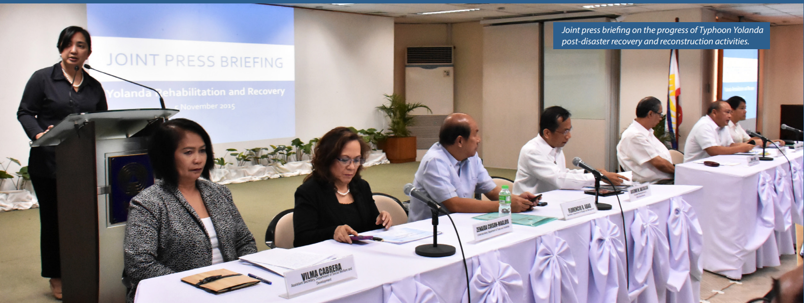
Joint press briefing on the progress of Typhoon Yolanda post-disaster recovery and reconstruction activities.