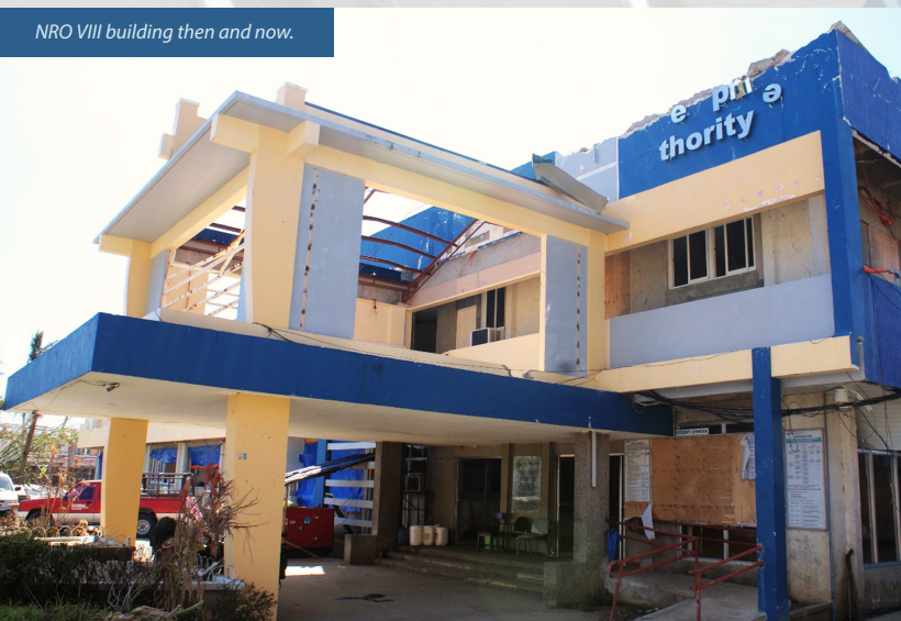
NRO VIII building then and now.

Upgrading of physical assets. The NCO and NROs continued building renovations that were started in 2013. New office buildings were completed for NRO XII and NRO-Caraga while NRO VIII had its building rehabilitated last year. Building improvements and renovations were also completed in the NCO including the installation of modular cubicle units. The NROs IV-B and IX, on the other hand, transferred to new offices. The renovation of the façade and landscaping of the front office of NRO VI were also completed. Meanwhile, the Philippine Statistics Authority (PSA) and its attached agencies moved to Eton Centris in Quezon City in July to consolidate business operations. The move is in accordance with RA 10625 or Philippine Statistical Act of 2013 which aims to harmonize and integrate the collection and compilation of data by various government agencies.